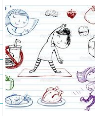
Your choices today determine your health tomorrow!

with some coworkers between routes, and drink plenty of water. Some pre-planning the night before can reduce your stress and save a few dollars.