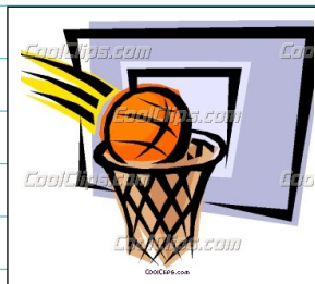
Bragging Rights and a Great Cause ONE NIGHT!

On Thursday, October 2nd at 6pm at RNE High School, Richland School District I & II will battle for bragging rights and compete to raise the most money for the Palmetto Health Breast Cancer Walk for Life/Race for Life. Admission is $5 for ages 6 and up.