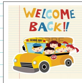
Drivers and monitors participate in In Service Training in August

The Training Department worked hard to ensure the In Service was informative and according to district protocol. A big "Thank You" to the staff and training crew for all the time and effort! Some much of the planning and behind the scenes tasks are taken for granted but we know YOU make it happen!